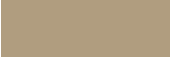
2 Stage Champagne